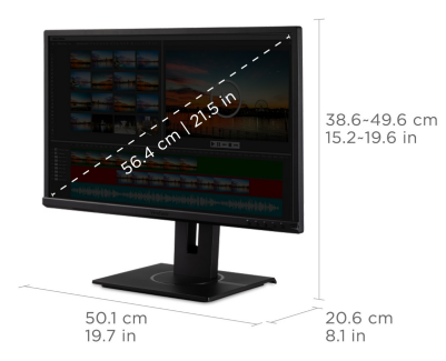
FULL HD (1920 x 1080P)