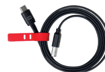
TYPE A/TYPE C USB CABLE