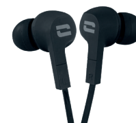
IPX4 WATERPROOF HEADPHONES